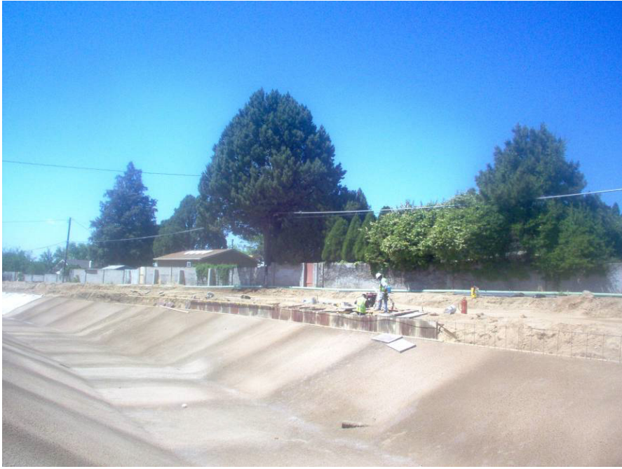
RMCI forming sill wall from Sta 13+30 to 11+00 Lt