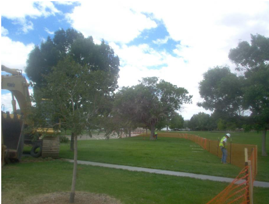
RMCI setting up work area with orange fencing and tree removal.

WORK DESCRIPTION: RMCI prepared MH base at Sta 5+79. Also prepared subgrade for the rundown at 6+50 LT. Crews working in the park putting up construction fence and cutting down the 2 ash trees as previously discussed. Indian Investors mob'bed their backhoe but will not start work until Monday.